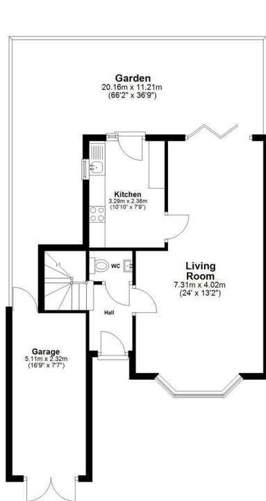
Ground Floor Approx. 54.0 sq. metres (581.5 sq. feet)